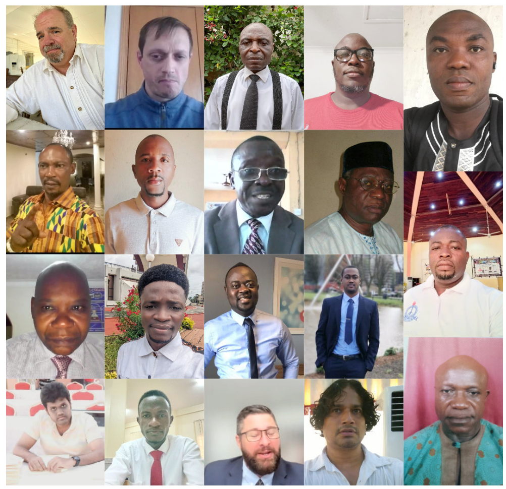
South Africa Convention Servants

and a Devotional Service conducted by Bro. Isaiah Amoo concluded a very profitable day for which we were most grateful. (Bro. Israel Loji)