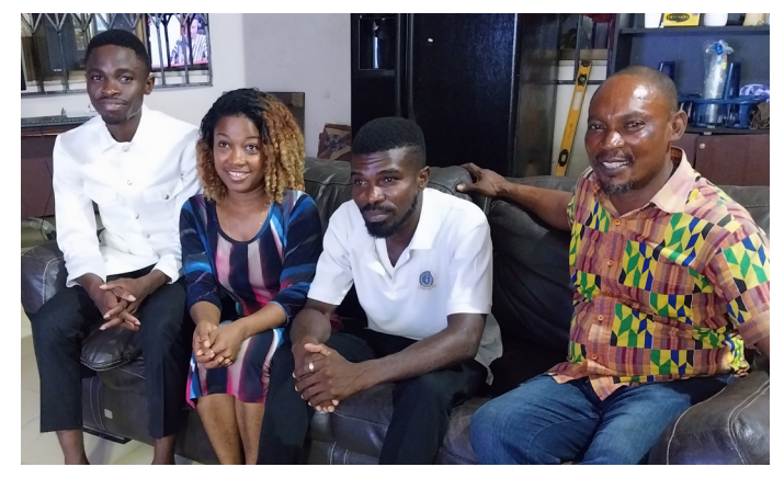
Report of Ghana Pilgrim Service Activities

we are seeing much seriousness in a few individuals and although they might desire to consecrate, we don't force any to do that when they are not ready. Nevertheless, we continue to pray for them. Lord willing, next month I will be in Cape Coast 2nd and 3rd December and in Dunkwa 8th to 10th December. Lord bless."