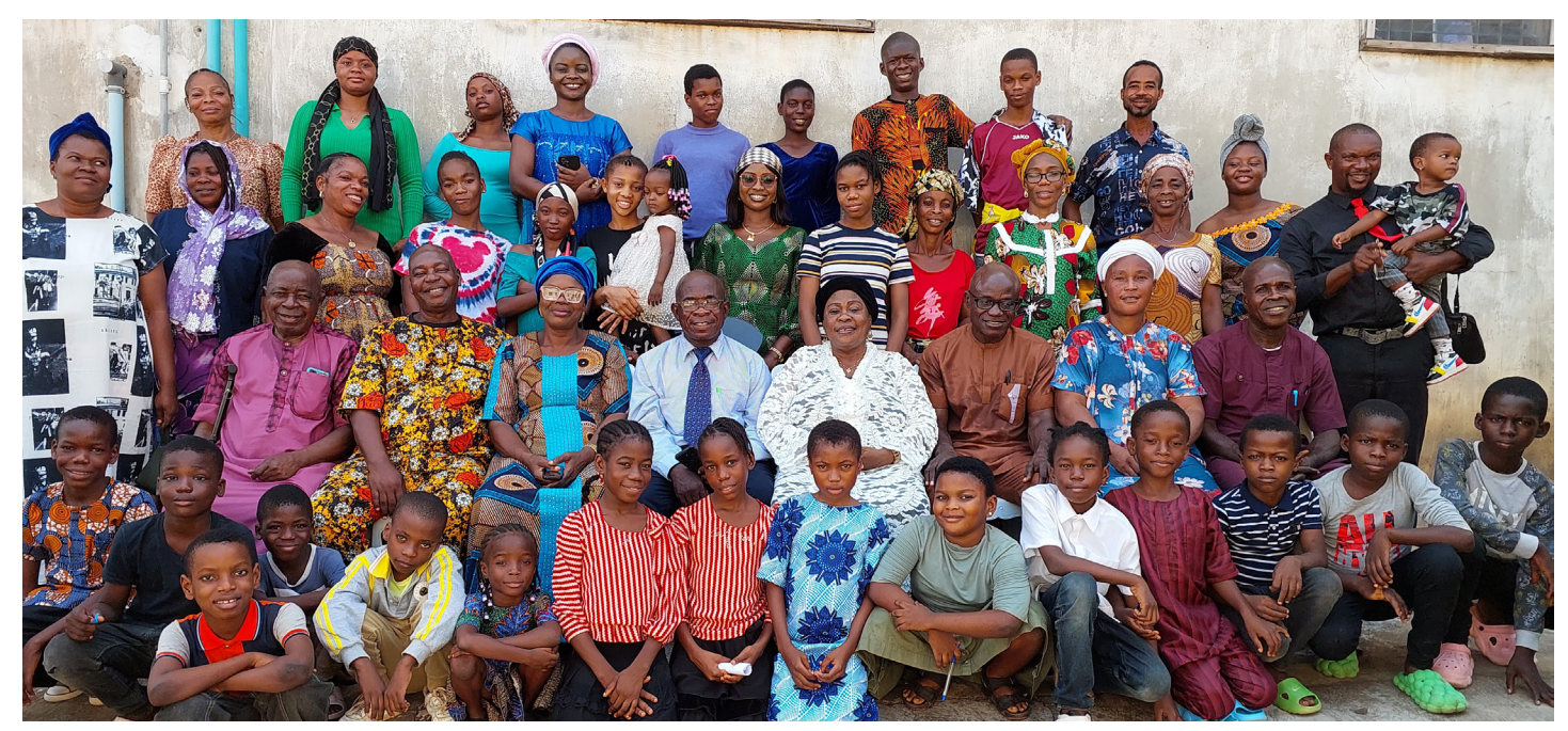
Ibadan Convention Attendees