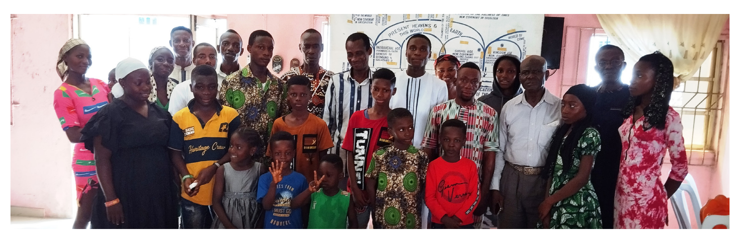
Ughelli Convention Attendees