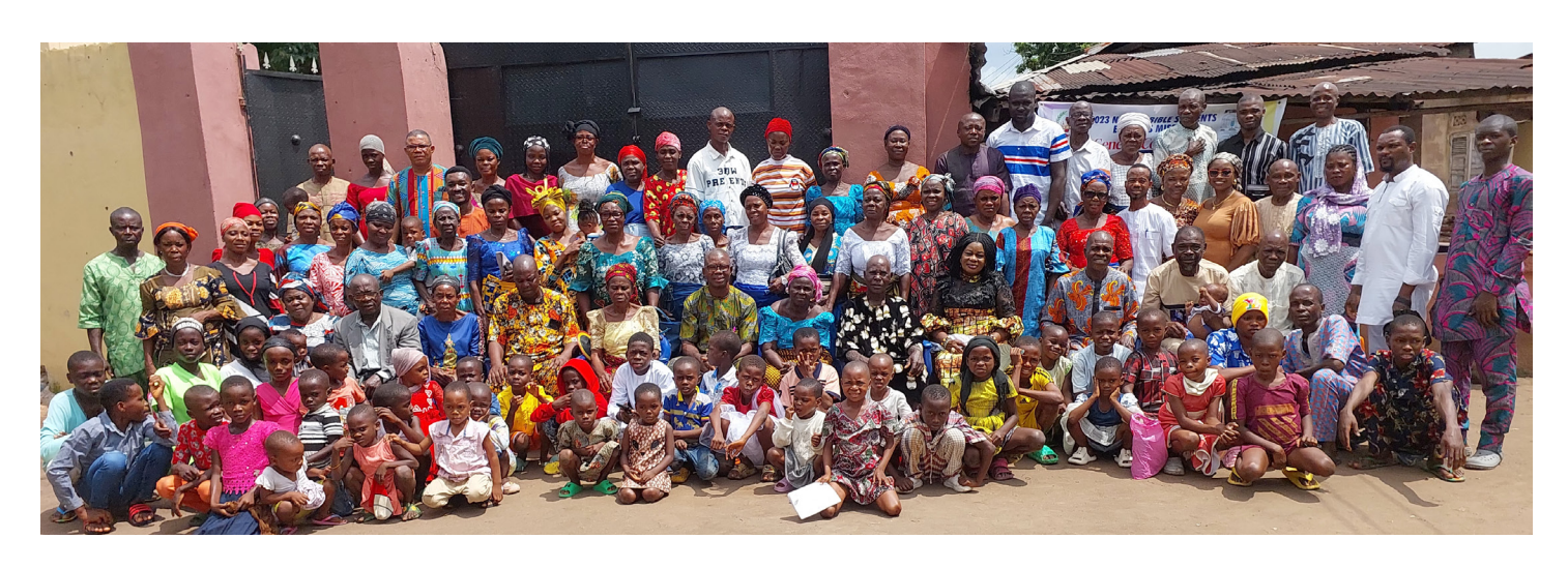
Group Photograph of Nigerian General Convention Attendees