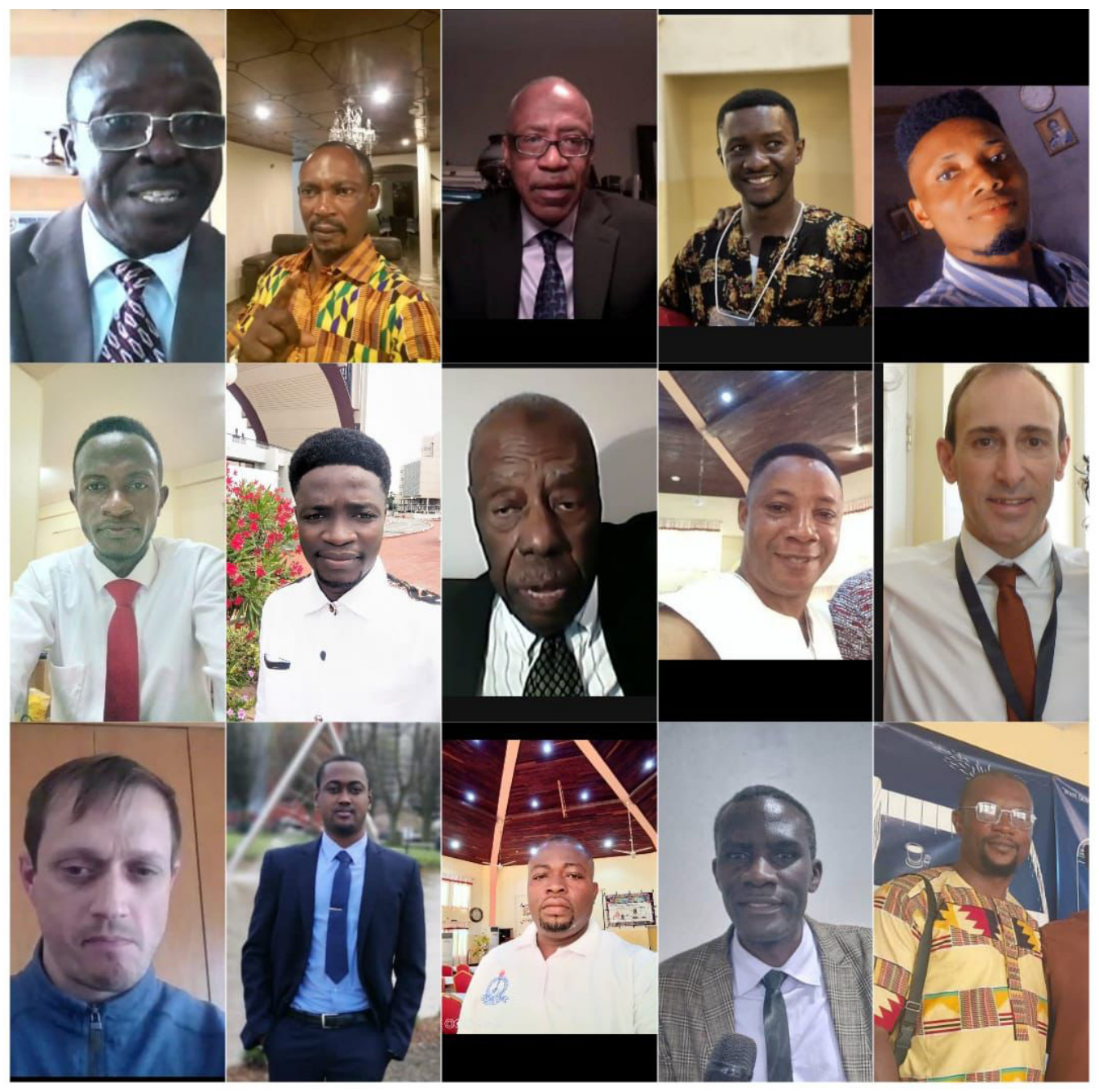
Servants at Ghana Year End Convention