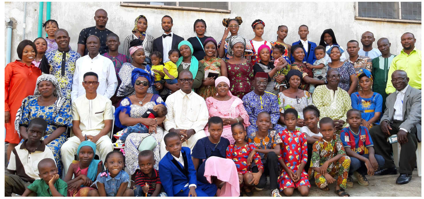
Ibadan Convention Attendees