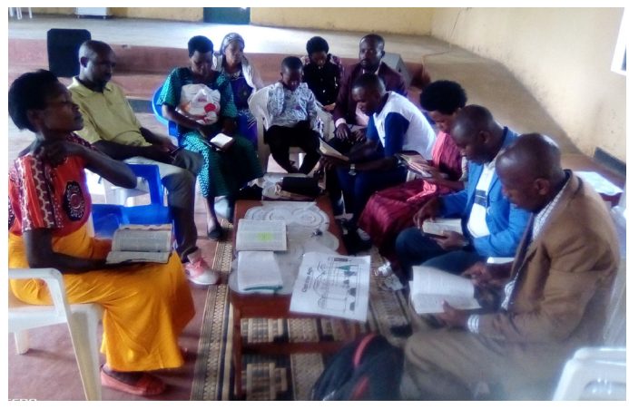
Study Session in Rwanda