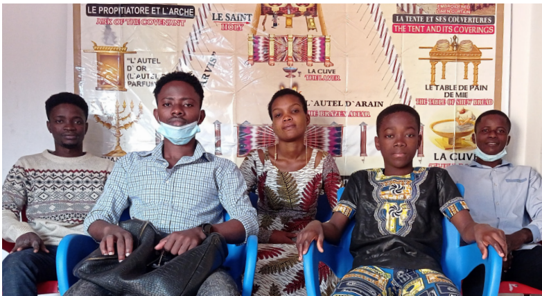
Some Members of Togo Ecclesia