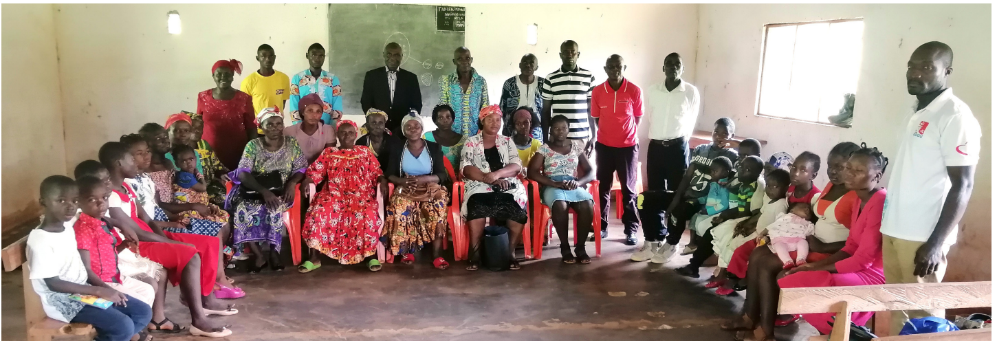
Cameroon Sunday Meeting Fellowship

We thank God for everything. The picture depicted is from our first Sunday meeting. Every first Sunday of the month we meet to study and eat together.