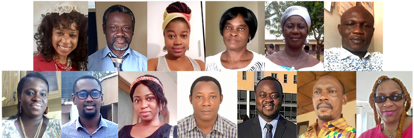
Kumasi Ecclesia Meeting Attendees