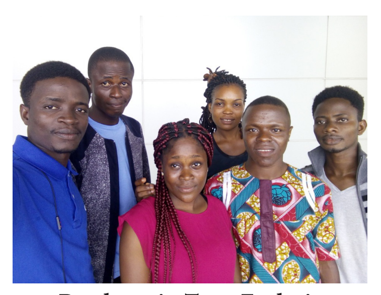
Brethren in Togo Ecclesia

During the pandemic, the brethren here continue to meet with regular frequency as before on Sundays, as a class, also joining with the Lamorlaye ecclesia in France, then subsequently with Highland Park in North America and finally, for an English