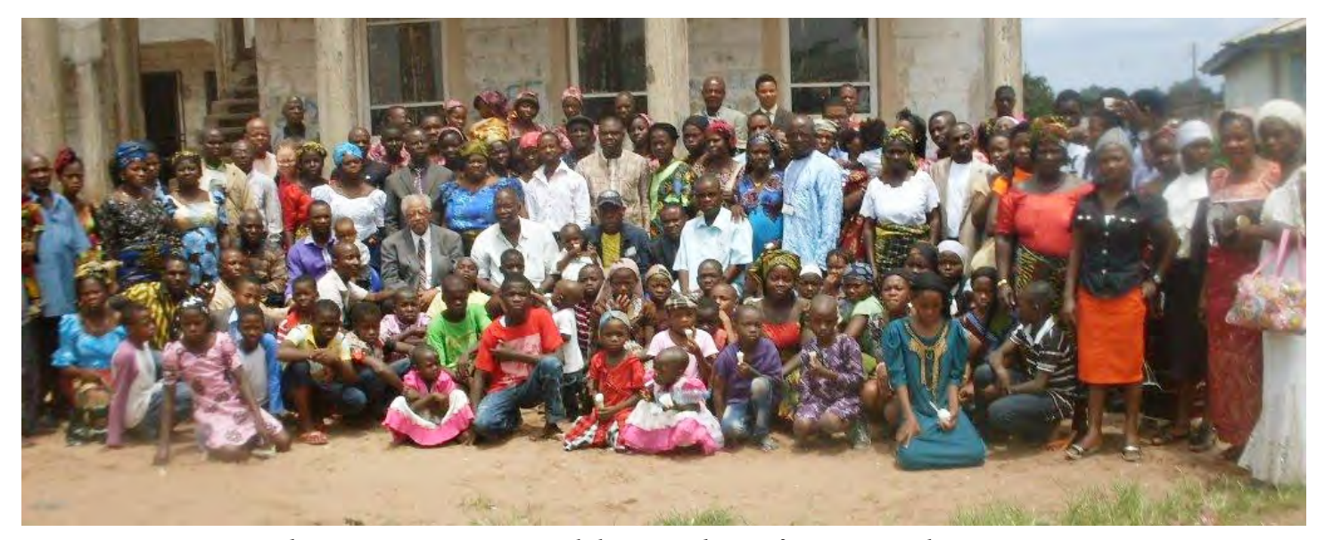
Attendees at Nigeria Bible Students' General Convention