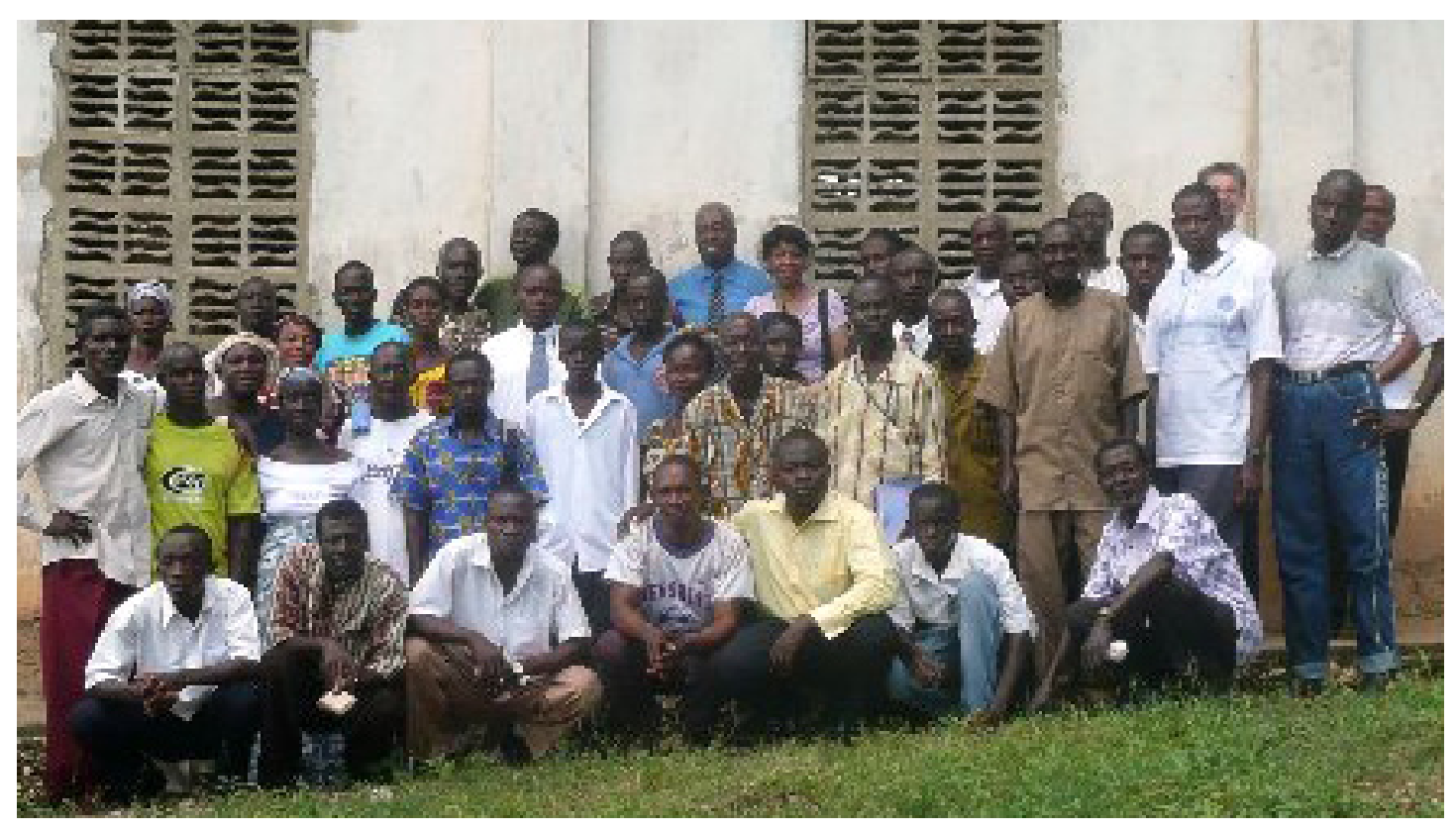
Group photograph of attendees at Dunkwa seminar

Additionally, another aspect of each pilgrim's responsibility is to coordinate an ongoing witness program to help insure that others who may have an interest in the Truth are reached through this initiative. It is hoped